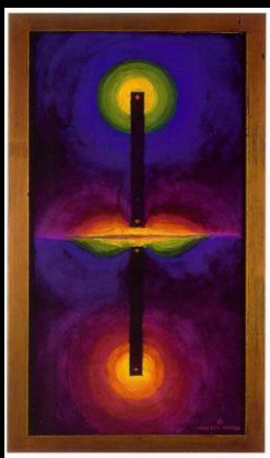
Formation of Stellar and Atomic Systems