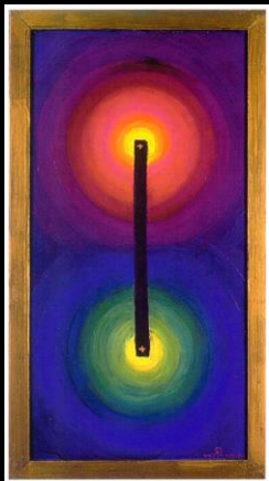
Natures Bar Magnet